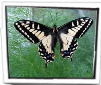
Above: Anise Swallowtail butterfly

I do this because I like to share what I think of as everyday miracles: the amazing feats that nature performs around us all the time and that we usually overlook.