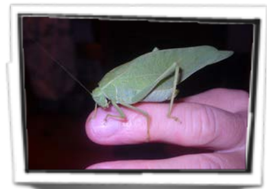
Above: leaf bug

Get to know your own backyard. Put out a hummingbird feeder. Try to identify the animal sounds you hear. Listen for crickets. Camp out overnight. A leaf bug landed on our screen door one night, and we brought it inside to look at for a few minutes. Amazing.